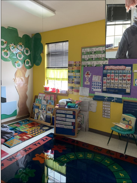
Burst pipes and flooded rooms after the Snow Storm in February 2021