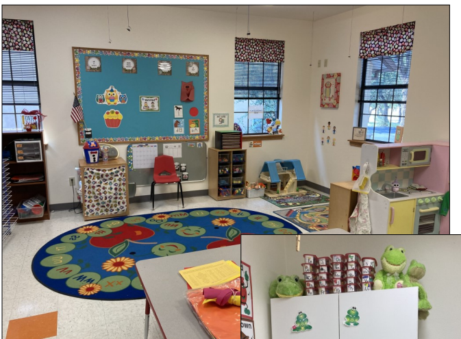
After reconstruction. Ready for the new School Year!